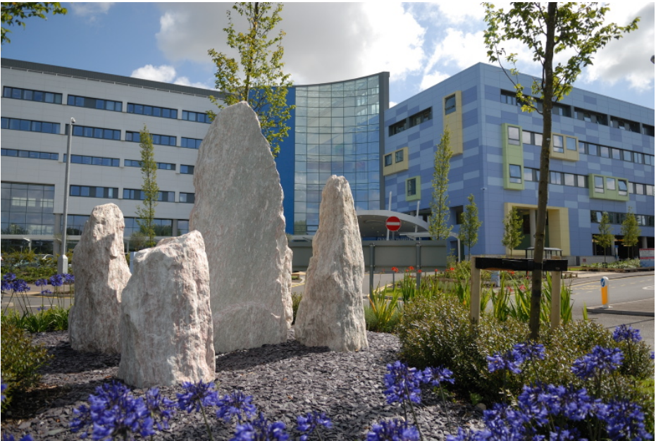
The West Wing and Children's Hospital, John Radcliffe Hospital

If the team think that CMS is likely, seeing you will help to decide which gene to test. We are also able to advise on drug treatments and other management for congenital myasthenia.