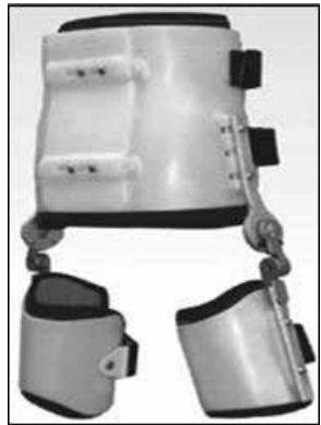
This is a 'Toronto' brace

It is made up of three sections; one section fits around the chest, and the other two parts are leg cups which wrap around the thighs. You will notice there are many screws on the brace (usually 14 in total). You will need to tighten all of these screws about once a week with the allen key provided.