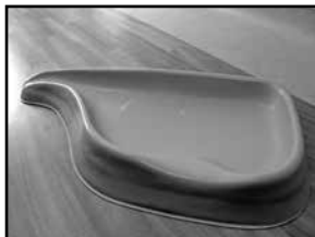
Hair washing tray

A hair washing tray may help you to wash your child's hair in bed. The Occupational Therapist at the Pre-Admission Clinic can advise you where to get one of these.