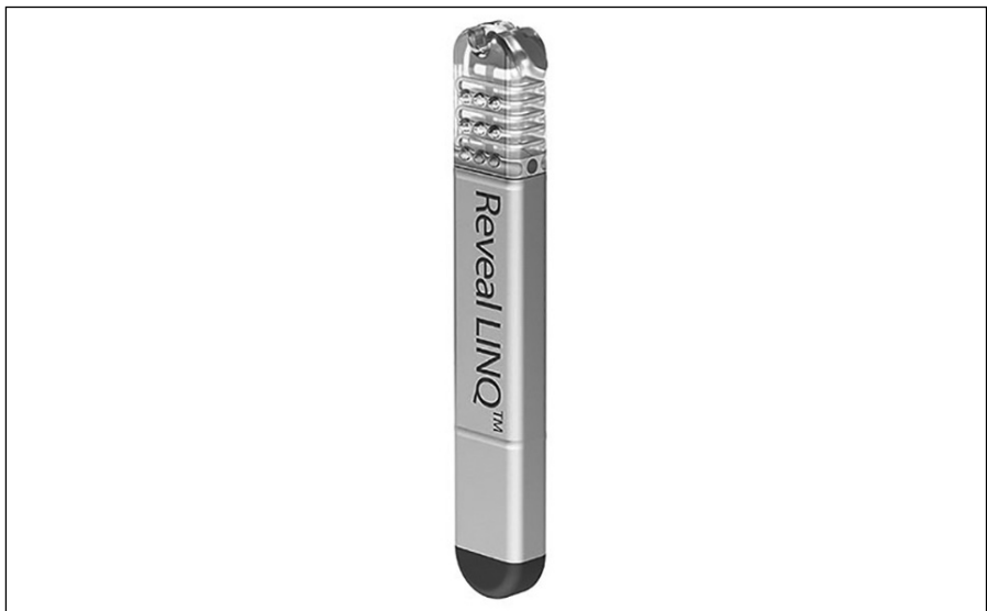
Reveal Linq™ Insertable Cardiac Monitor