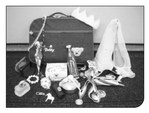
Toys used during the AHA assessment.

The upper limb assessment includes a thorough clinical examination. This will involve us assessing range of motion and muscle strength whilst sitting on a couch. Following this, we will proceed with the appropriate upper limb assessment which will be guided by the referrer and physiotherapist conducting the session.