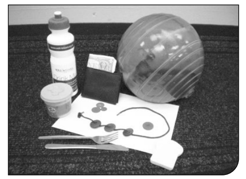
Items used during the SHUEE assessment.