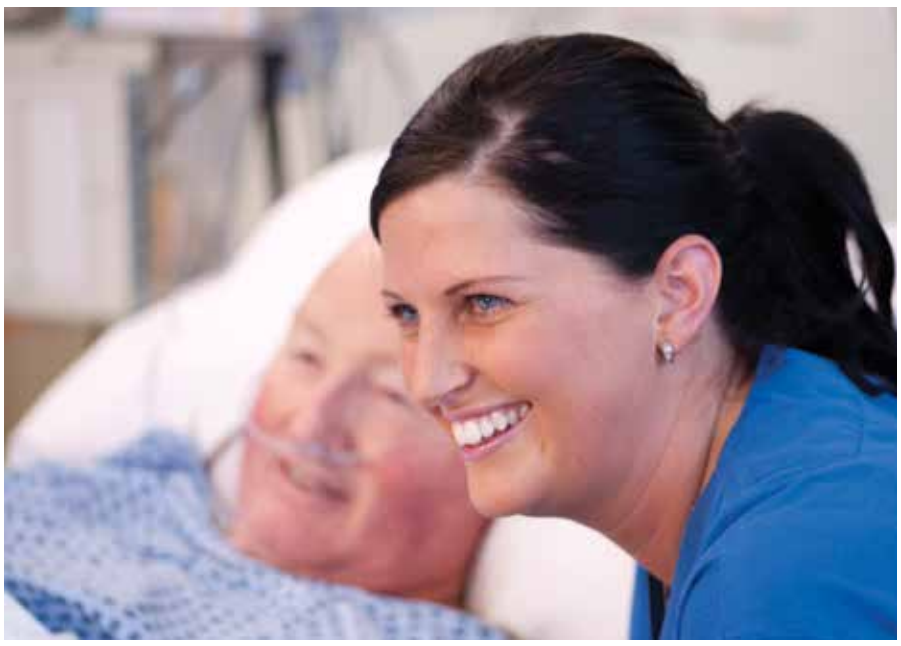
page 2 Life after discharge from ICU