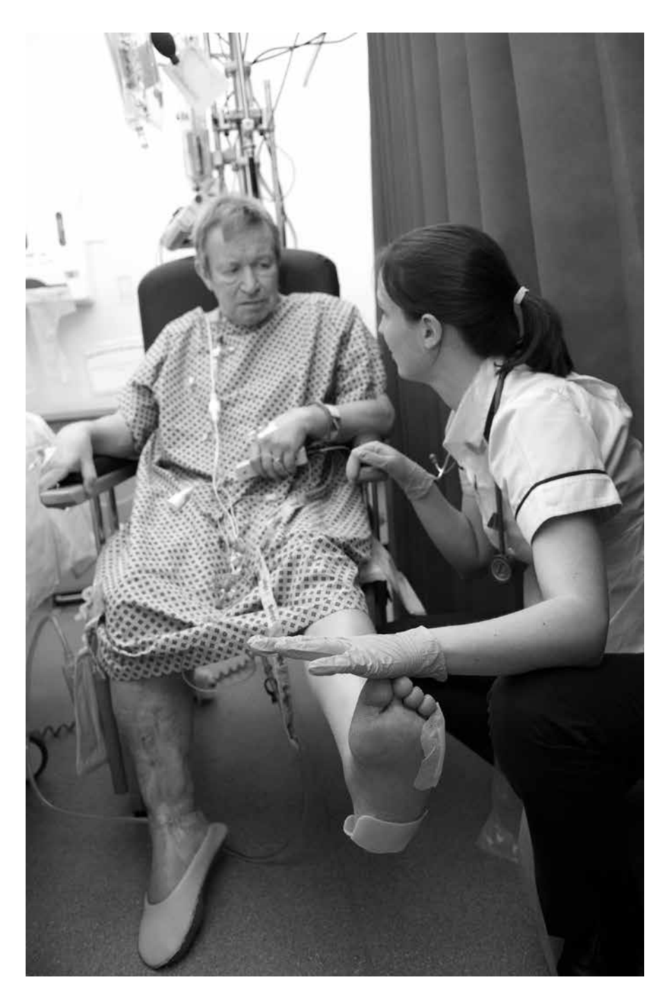
page 4 Life after discharge from ICU