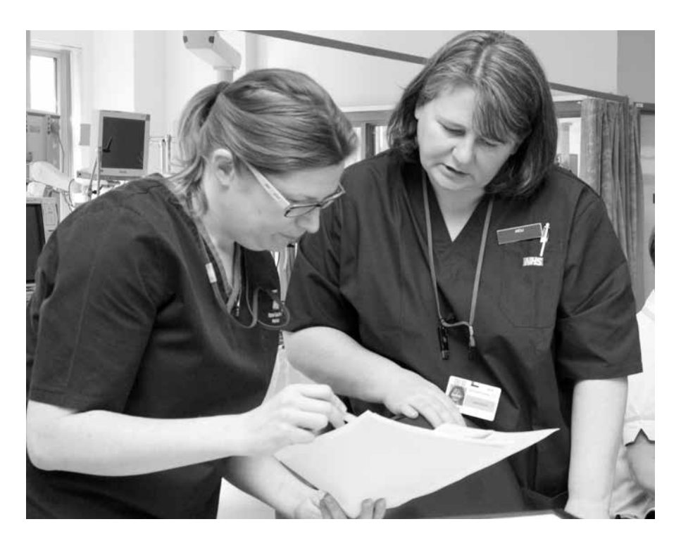
Life after discharge from ICU page 11

The hospital chaplains are also available to speak to you and your family, if you wish.