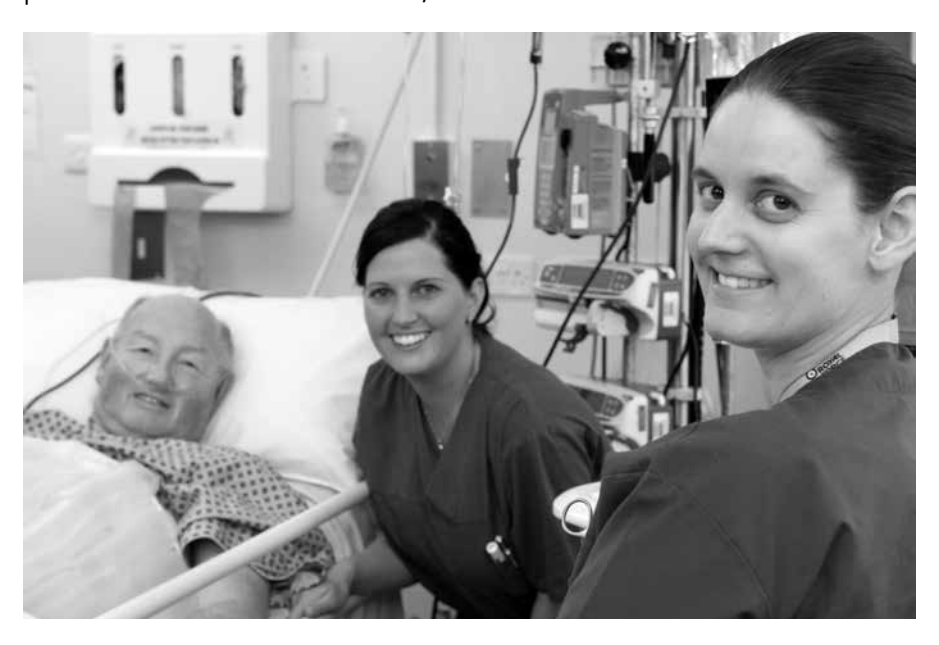
page 6 Life after discharge from ICU

When you are transferred to a ward you may be starting to eat normally but are likely to still need some supplementary food by tube or intravenously, to keep you well nourished. The ward dietitian will review your needs and you may be given high protein meals or foods/drinks, fortified with extra nourishment.