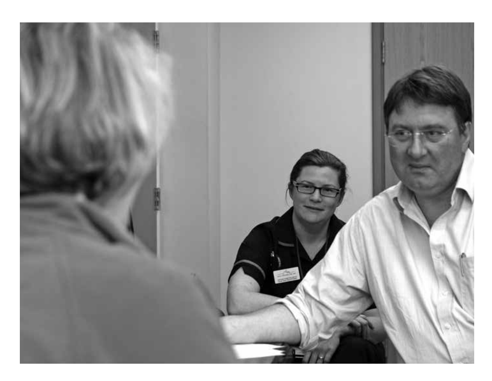
Life after discharge from ICU page 13

Email: criticalcarefollowupteam@ouh.nhs.uk