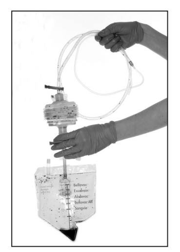
Wound drain with bellows and bag