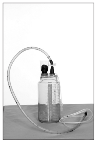
Wound drain with bottle

A wound drain is a thin plastic tube that has one end placed under your skin in the area where you have had surgery. It is used to remove the fluid that collects in this area of your body after an operation. The other end of the tubing, which is outside your body, is attached to a bottle or bellows and a bag, as shown below. This is where the fluid is collected.