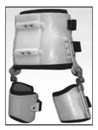
This is a 'Toronto' brace

It is made up of three sections; one section fits around the chest, and the other two parts are leg cups which wrap around the thighs. You will notice there are many screws on the brace (usually 14 in total). You will need to tighten all of these screws about once a week with the allen key provided.