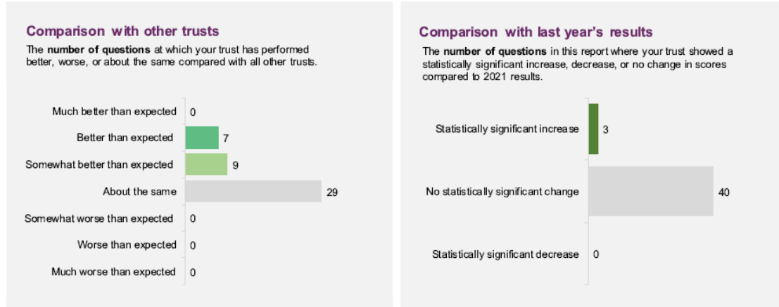
Chart 2: Comparison with other Trusts and Comparison with the previous year's results.

4.6. The benchmarked results are results show that the Trust results were better than other trusts for 16 questions, about the same as other trusts for 29 questions. The Trust did not rank in the ‘worse than other trusts’ for any questions. Please find the list in Appendix 1 and this is represented in Chart 2 below.